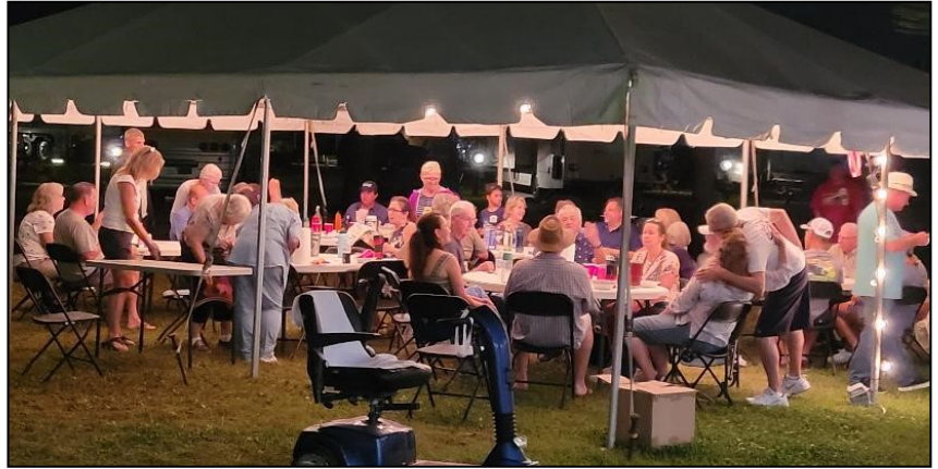
The nights of the rally were mild, and having a pavilion with a lighted ceiling worked out beautifully. The campground clubhouse was new and modern, and although it was not large enough for group dining, there was an adequate serving kitchen for our purposes.