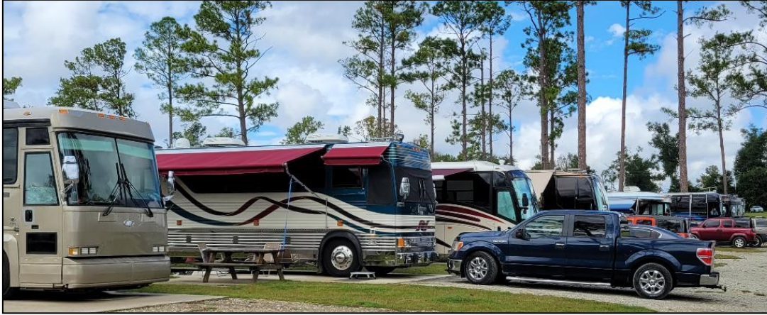
Some 21 coaches came to the Autumn Rally, some as old as a 1947 GM up to late model Prevosts. The weather was great, as was the wonderful spirit of camaraderie!