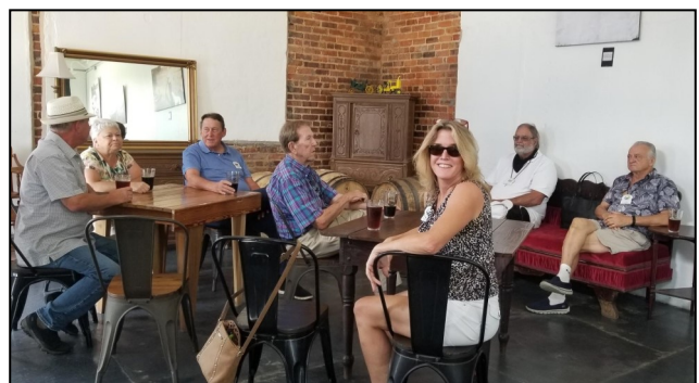
A mix of BusNuts are relaxing in the tasting room after a tour of the Southern Fields Brewery in nearby Campbellton, FL. The products were deemed quite refreshing!