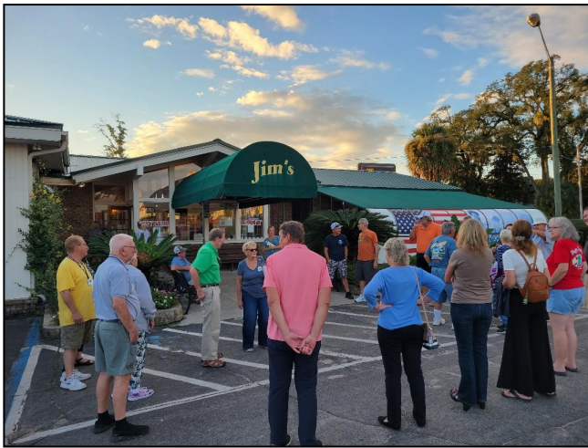
We caravanned to our Thursday night dinner venue, Jim's Buffet and Grille, which is famous for its southern cooking and reasonable prices. We were among the first to be seated!