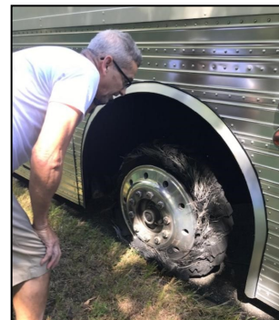
The Montesinos blew a steer tire enroute back to Winter Haven, FL, but despite poor performance from their road service, they made it home safely.