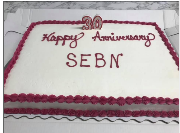
Our Saturday dinner concluded with a special commemorative birthday cake, and a rousing chorus of "Happy Birthday"!