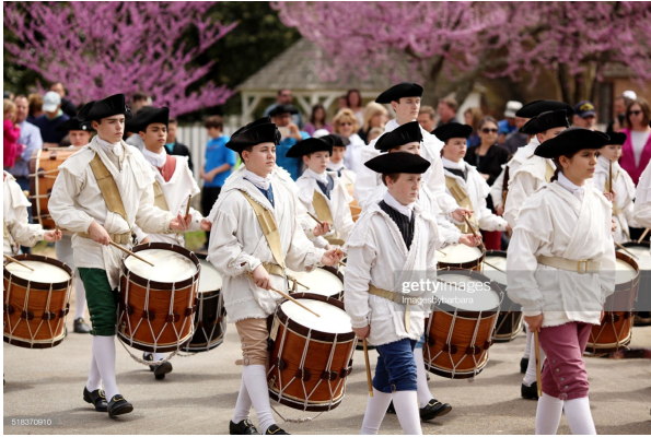
HISTORIC WILLIAMSBURG, VA!