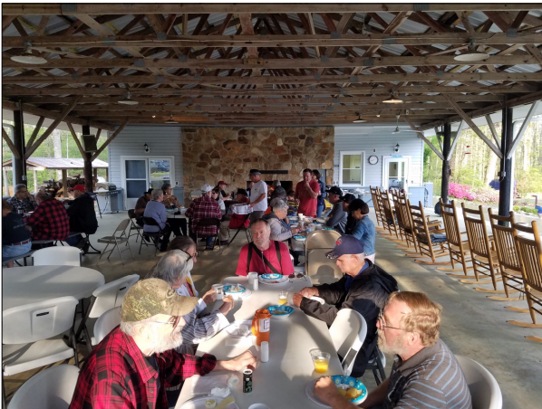
Several meals were enjoyed under the open portico at Palmetto Cove, including the meatball sub opener on Thursday night.