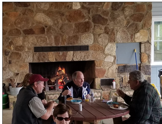
A cozy, warming hearth. - It really took the chill off for Saturday's breakfast, a European affair with hard boiled eggs, cheeses, smoked ham, and coffee.