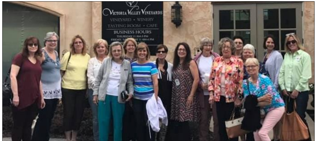
Most of the womenfolk dined Saturday at Victoria Valley Vineyards, just two or three miles from the campground, while the men did the burger thing back at the ranch.