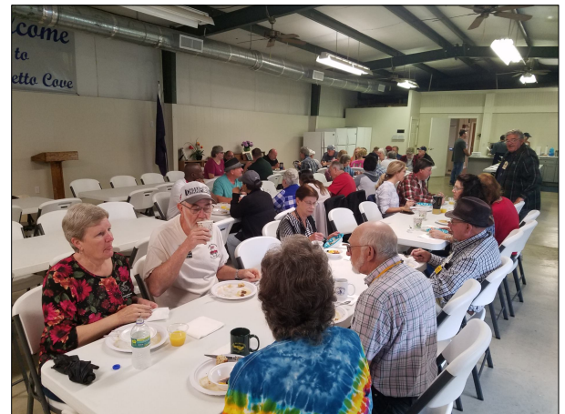
The main function room at Palmetto Cove has undergone a major facelift and upgrade since our last rally there two years ago.