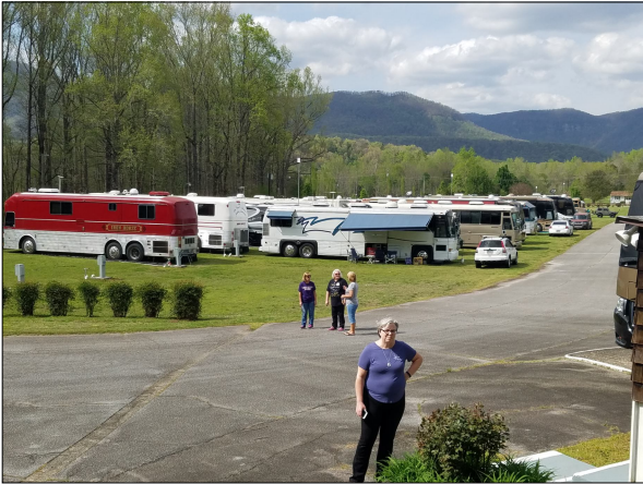
Some 31 rigs joined up at Palmetto Cove. The park has very panoramic views and sits in a pleasant valley.