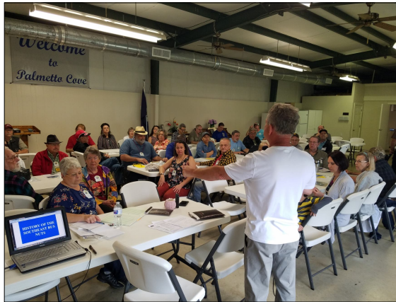
Our general membership meeting on Saturday included a 15 minute slide presentation on the birth and growth of the SEBN.