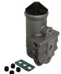
The notorious Bendix D-2 governor.