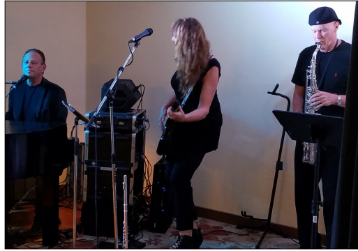
Music on the first night was provided by the Ross Duo Plus One, a great local group.