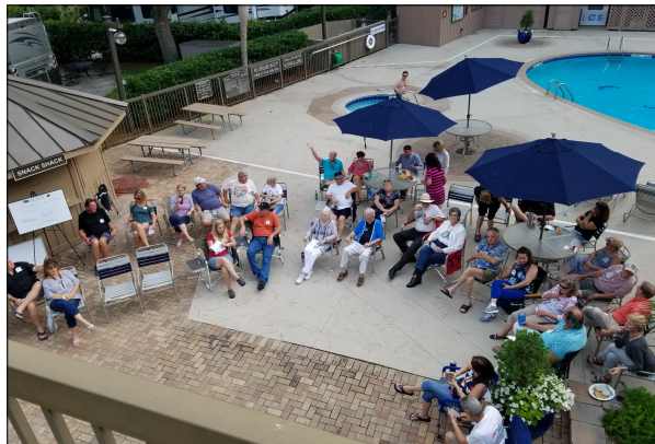
Most of the registrants for the Hilton Head rally showed up for meatball subs at poolside on Thursday night.