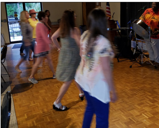
Line dancing was very popular among the ladies at Saturday's banquet. The steel drum musician made it feel like a cruise ship!