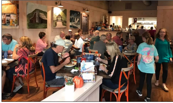
On the first night we literally took over the Dillard Café, for some real home cookin', including fried green tomatoes.