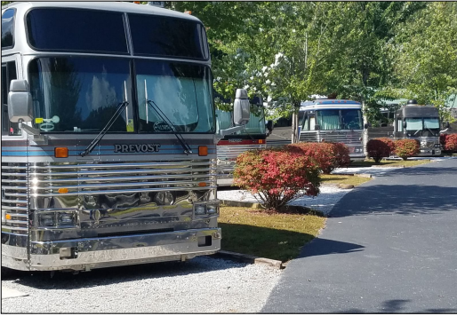
River Vista was a very pretty park, beautifully maintained, and our coaches were centrally gathered.