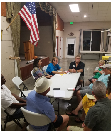
The advisory board met late into the night Thursday, coping with treasurer and website issues.