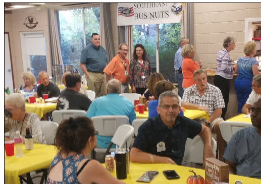
Two hot breakfasts and two home cooked dinners kept attendees happy and well fed.