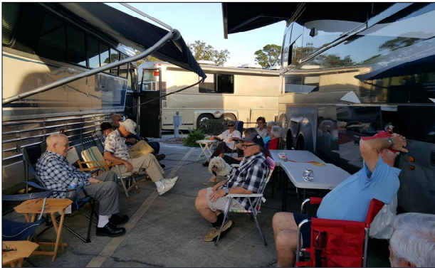
Awning-to-awning: lots of time to visit during the days and late afternoons at the Post-New Years Rally.