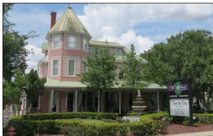
The Ivy House—a dining treat!

the rally fee!) The menu lists salads in the $10.00 range, and sandwiches in the $9.00 to about $11.00 range. Ladies please know