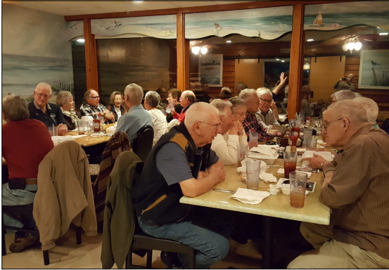
Diners at Dixie Crossroads enjoyed private seating and a very inexpensive dinner with several seafood offerings.