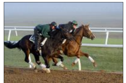
Ocala is famous for its thoroughbred breeding and horse farms.