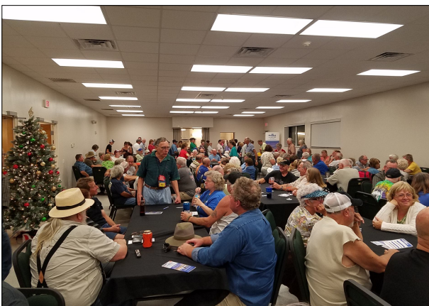
About 185 busin' enthusiasts attended the 16th annual Arcadia gathering. The indoor facilities were comfortable and conducive to visiting.