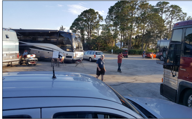
All of the coaches were able to fit into the cozy rally park at sprawling The Great Outdoors RV, Nature and Golf Resort in Titusville, FL.