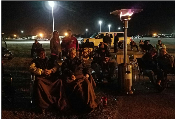
There was outdoor musical entertainment on two nights at the Arcadia rally, and heat lamps helped with the chill.