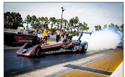
The Don Garlits museum is a must for all motor-heads and bus nuts!