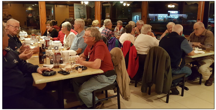
Yes, those are coats on the backs of chairs. The rally weather was great except for one day of chilly rain.