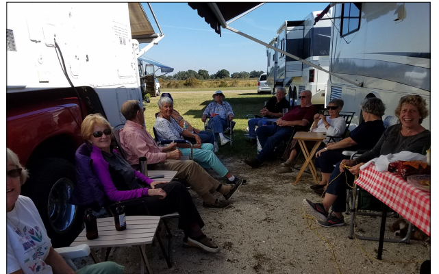
SEBN members and non-members alike met and renewed old acquaintances. The days were pleasant and the sunsets were spectacular!