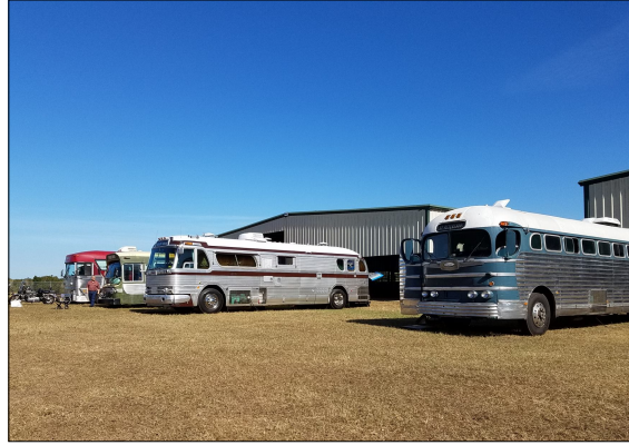
Buses of every vintage made the trip to Arcadia—almost 90 coaches. The weather was mild and sunny during the days, and a bit nippy in the evening.