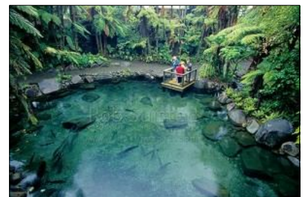
Silver Springs State Park is home to crystal clear waters.

To register, go to our chapter website www.sebusnuts.org and click on the rally button. Choose to pay either with a credit card or PayPal. Done! If you would prefer to send a check, make it out for only $185. payable to SE Bus Nuts, and mail to Treasurer, 5337 N Socrum Loop Road, Box 203, Lakeland, Florida 33809.