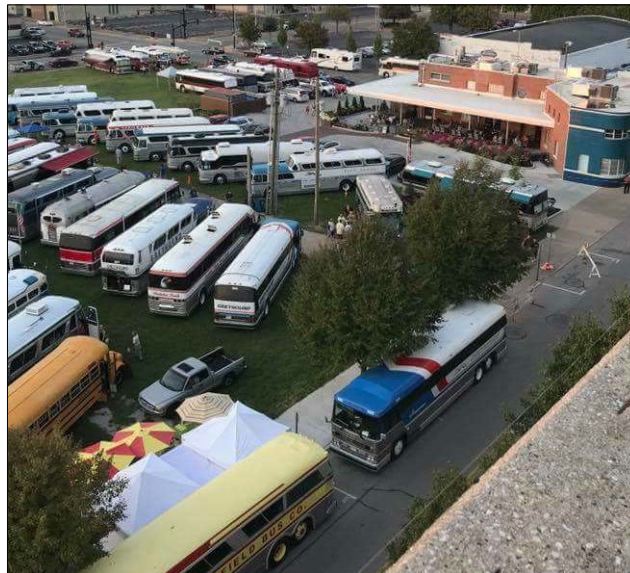
Antique Bus Rally— Several SEBN members attended the recent vintage bus rally and parade out in Evansville, Indiana. See p.4 for story.

changes. As you probably know the hot issue is concerning allowing "non-motorized" units to participate in the Family MOTOR Coach Association. As a member chapter, our vote is to support the proposed by-laws changes as presented. Hoping you all have the opportunity to vote what you feel is best to continue the growth of the legacy of our parent organization.