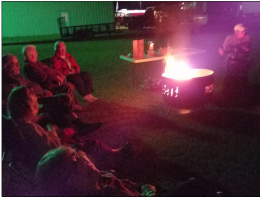
A warming campfire on Wednesday night!