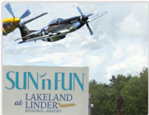
Campground & aviation museum