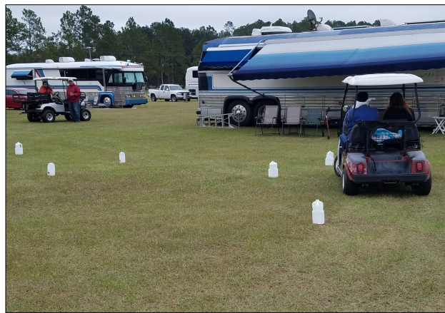
The serpentine course for the cart race was rather challenging, especially when driving blindfolded!