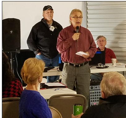
Most rally attendees participated in the Chapter’s annual meeting on Friday morning.