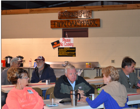
We were able to use the newer dining facilities at Twin Oaks... Much nicer.