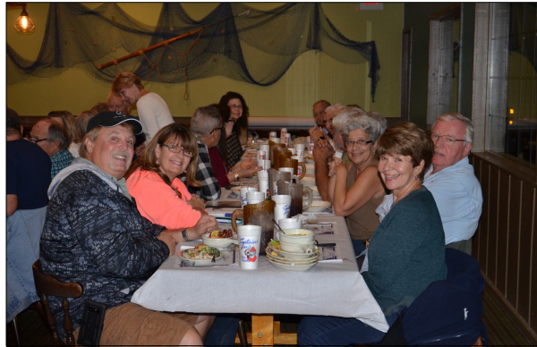
Thursday dinner out was at Captain Joe's Seafood in nearby Waycross, GA.