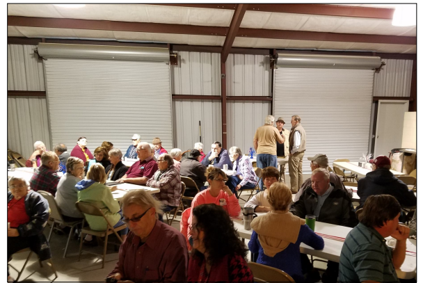
Friday began with a home-cooked Breakfast Casserole, along with juice and coffee.