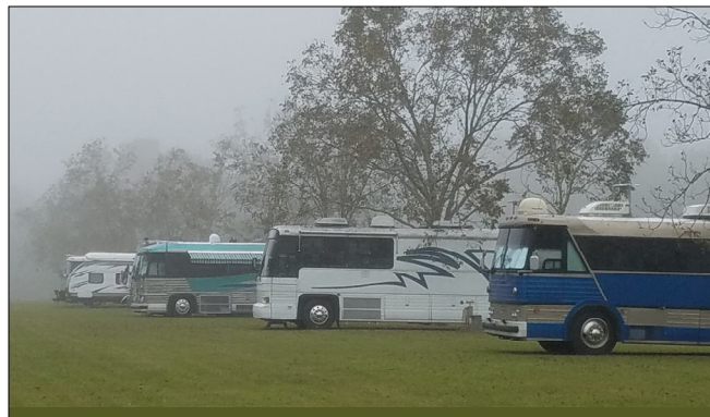
Early Hoboken rally attendees awoke Thursday morning to a heavy fog, but weather throughout the rally was mostly OK.

In an effort to have increased volunteers who "step-up" and host a rally, your board agreed we will be changing our policy to allow the PRIMARY host to attend their hosted rally without a rally fee. It is just a give-back thank you for helping host and is intended to ENCOURAGE more volunteers to take on the hosting task...a task that has really become much easier with the behind the scenes help of our treasury, public relations, and co-hosts.