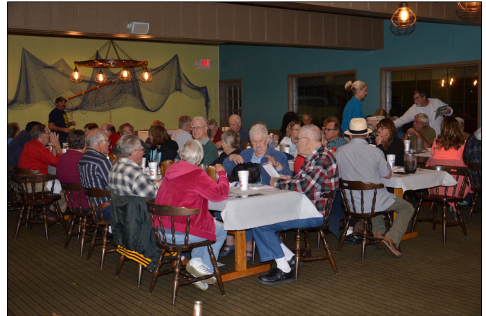
The Thursday dinner "out" at Captain Joe's was a near sell-out. The restaurant specializes in seafood.