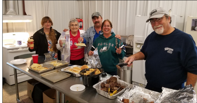
Pancakes and sausages, served hot and with a smile by the Showmans.