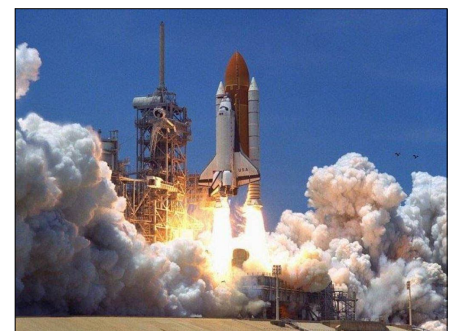
Nearby is the Kennedy Space Center and the US Astronaut Hall of Fame.

Campsites are 30 amp electricity and water. Dump station adjacent. There are 23 sites with hook-ups, but we got in about 30 coaches last rally there by sharing electric and water.