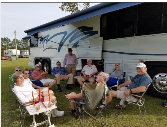
Early arrivals had a chance to visit before Thursday night's Dutch-treat dinner at a new cafe in Waycross.