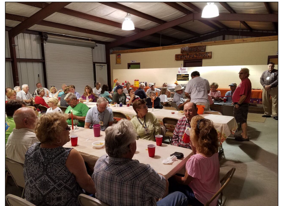
The Chapter made use of the newer meeting facilities at Twin Oaks, which were more modern and inviting than the original clubhouse.