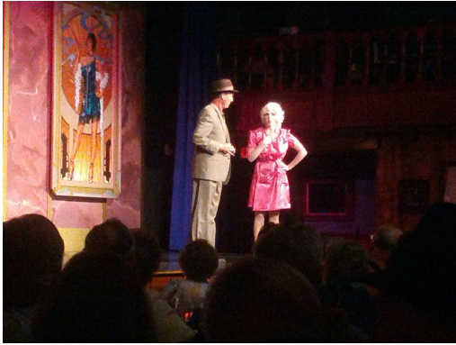
The Al Capone Show was a fun affair, and the dinner theatre was located just a few minutes from the campground. All but two couples at the rally went to the affair.