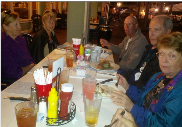
Two full tables were eating outside at the Friday dinner at the Market Café in downtown Celebration.