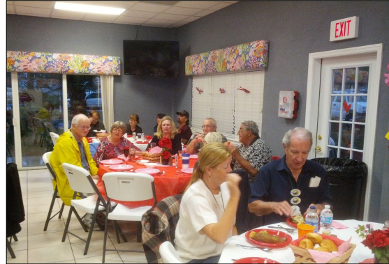
The St. Valentine's dinner and dance was great fun, and the food and music were very enjoyable!