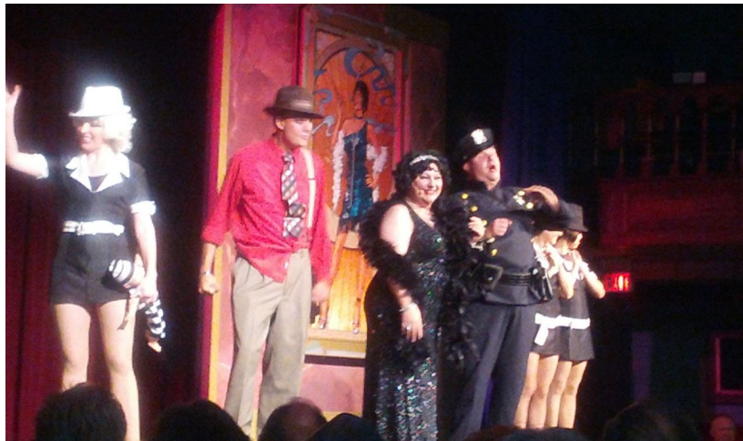
The Saturday dinner-theatre at Al Capone's club had its share of melodrama.