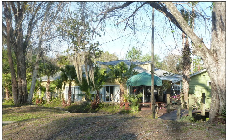
The Tropical Palms clubhouse, very tropical indeed!

The resort itself was nearly full, but thanks to the planning of rally hosts Bryan and Suzanne Bowman most of our coaches were grouped together.